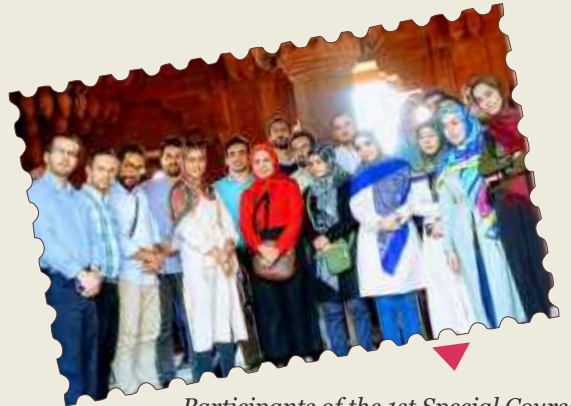
Participants of the 1st Special Course for Tunisian diplomats visit Rashtrapati Bhawan on 2 November 2018