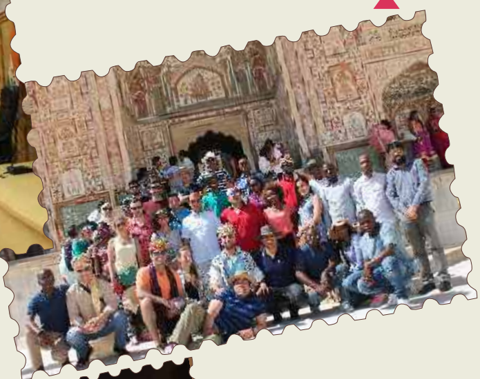
Visit to Jaipur by the participants of 65th Professional Course for Foreign Diplomats (PCFD) on 29 March 2018