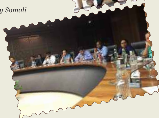
Participants of the 66th Professional Course for Foreign Diplomats (PCFD) visit the office of Infosys Limited on 1 October 2018