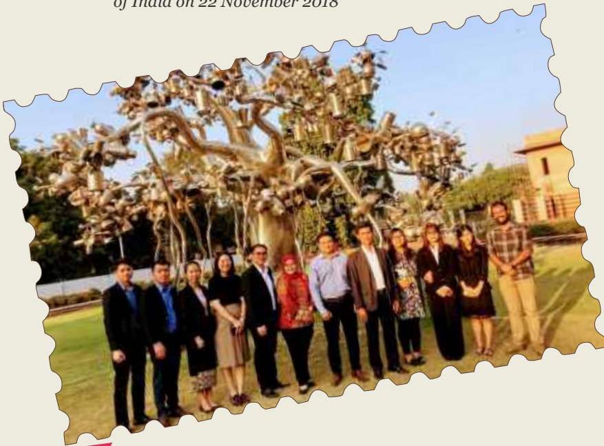
12th Association of Southeast Asian Nations (ASEAN) course participants visit the National Gallery of Modern Art, New Delhi on 23 November 2018