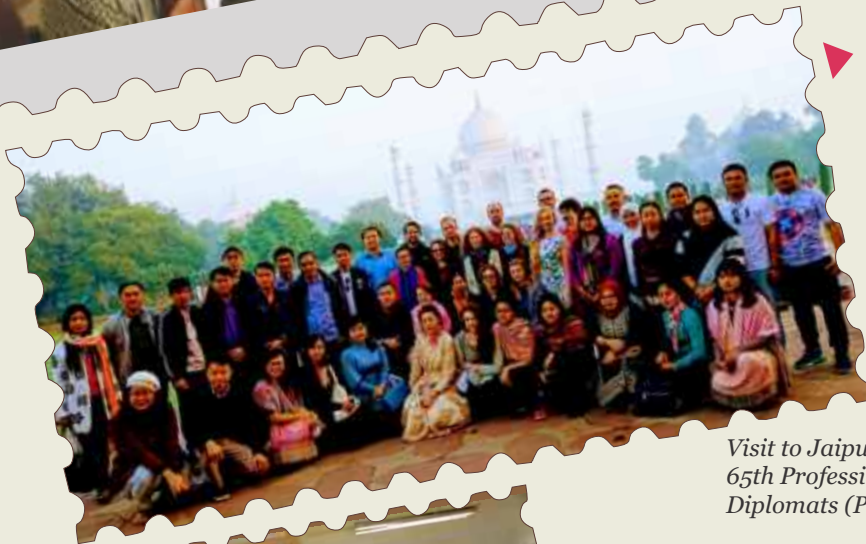
12 Association of Southeast Asian Nations (ASEAN), 4th Asia-Europe Meeting (ASEM) and 1st Special Course for Myanmar diplomats visit the Taj Mahal, Agra on 18 November 2018