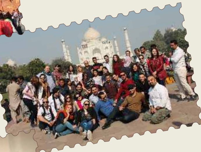
◀ Iraqi & Syrian Diplomats visit Taj Mahal on 20 January 2018