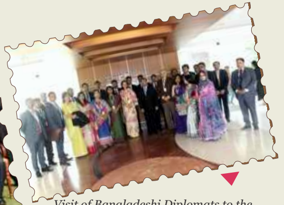
Visit of Bangladeshi Diplomats to the office of Tech Mahindra, Hyderabad on 26 November 2018