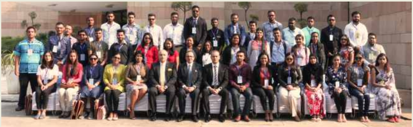
Participants of Know India Programme, 2018