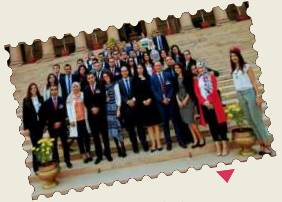
Visit to Fatepur Sikri by Iranian diplomats on 2 December 2018