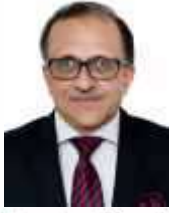
From the Dean's desk