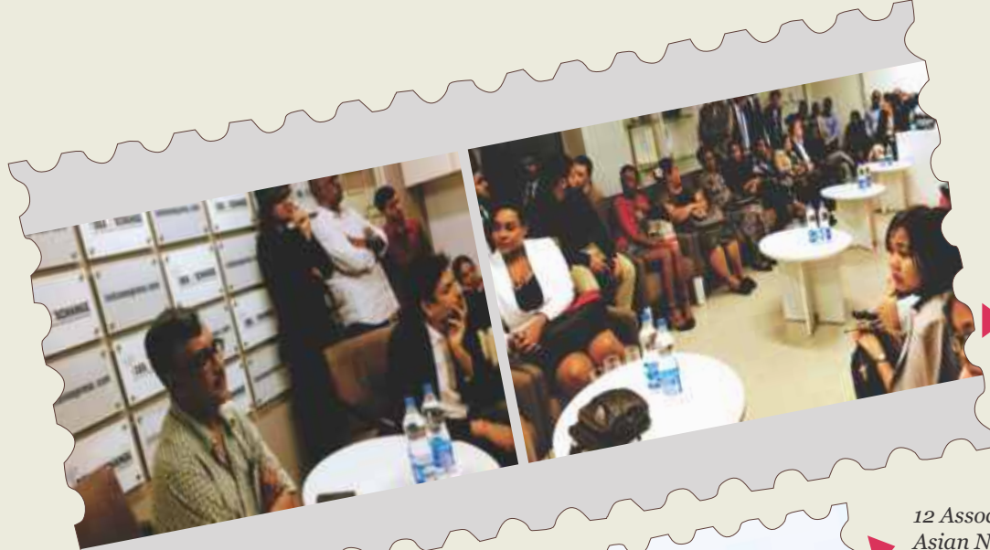
Participants of the 66th Professional Course for Foreign Diplomats (PCFD) visit the Indian Express Office on 24 September 2018